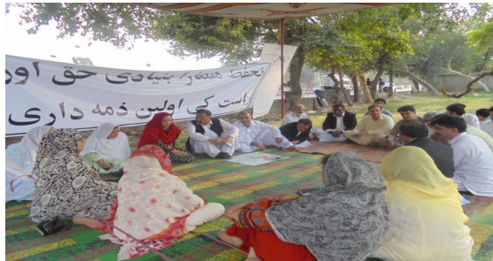
KK male and female staff at the protest